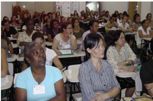
Students attending a weekly training class and (inset) the local director demonstrates the visual lessons "Who is God?"