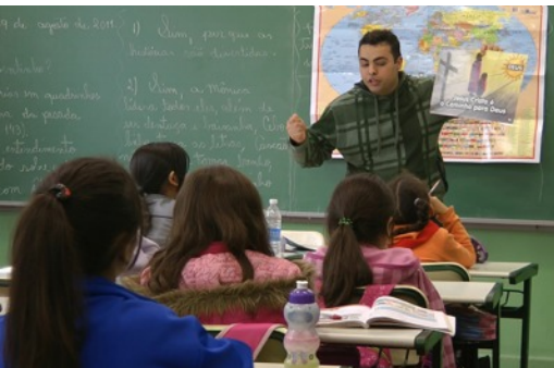
Using the visual lessons in a weekly Bible class in an elementary school